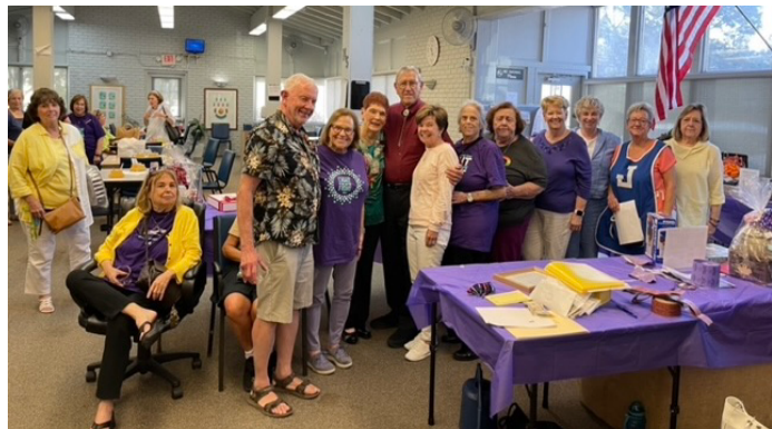
A Team Effort