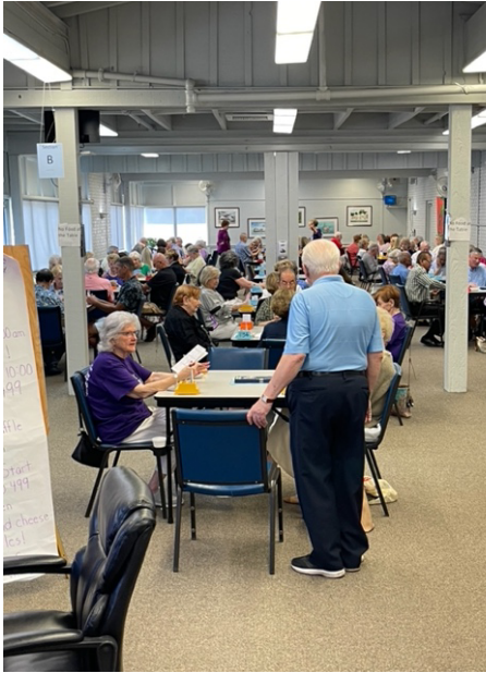
A Good Crowd