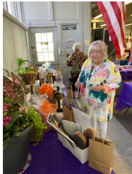
Selecting raffle items